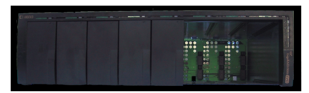
Figure 5: A shelf with five bricks inserted and three empty spaces.

CAN buses. A photograph of a ROC-1 brick connected to the backplane appears in Figure 4, and a photograph of one ROC-1 shelf appears in Figure 5.