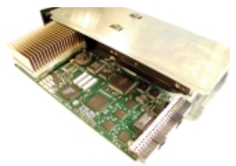
Figure 2: A ROC-1 brick. The processor board is shown partially removed from the canister, and with its disk removed.