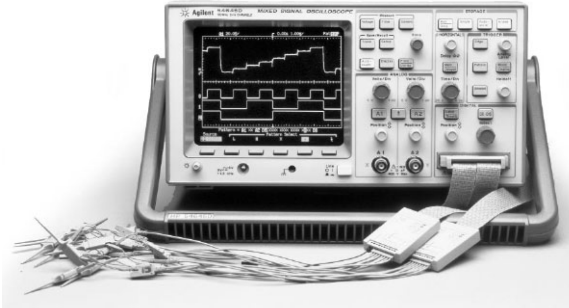
Figure 6: HP54645D Mixed Signal Oscilloscope

Shown in Figure 6 above, is the HP54645D Mixed Signal Oscilloscope, which we will generally refer to as simply “the oscilloscope” or “the logic analyzer.” It is in fact a combination of these instruments, both of which are designed to graph waveforms (analog and digital respectively) over time. In this class we will almost exclusively use the logic analyzer portion of these devices, since this is a digital systems class.