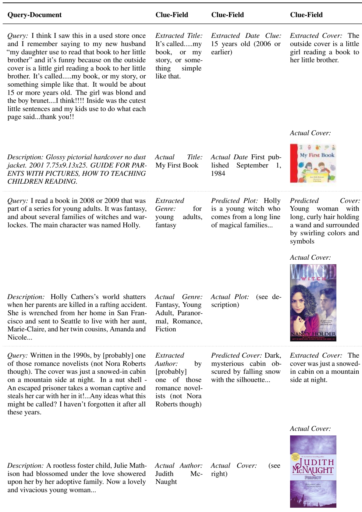
Table 2: Query-document pairs, their generated sub-queries or clues , and corresponding gold document fields. Clues can be extracted directly from the query or predicted as a best-guess attempt to match the actual document field. Clues can be about the book’s title, author, date, cover, genre, or general plot elements.