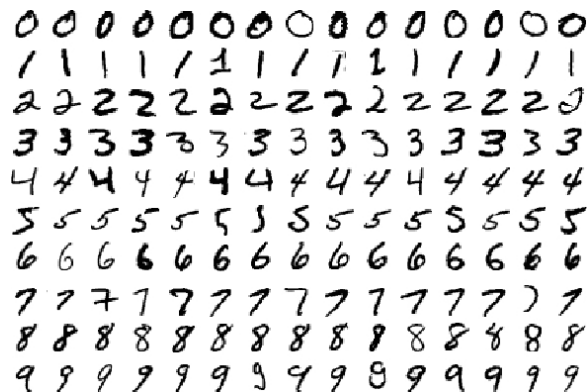
Figure 1: Examples from the MNIST dataset.