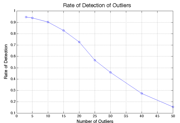
Fig. 2. This plot shows the rate of detection of outliers for a given number of inserted outliers. The rate of detection decreases as we insert more outliers in the data.

We then calculate the rate of correct detection for different number of outliers in the dataset. Figure 2 shows the drop in rate of correct detection of outliers as the number of outliers increase in the dataset. Similar to before, we perform 50 iterations of Monte Carlo Simulation and plot the mean value of rate of detection. In every iteration, a new set of randomly generated indices were selected for inserting outliers. We range the number of outlier insertions from 3 to 50 points for a dataset with T = 85 data points.