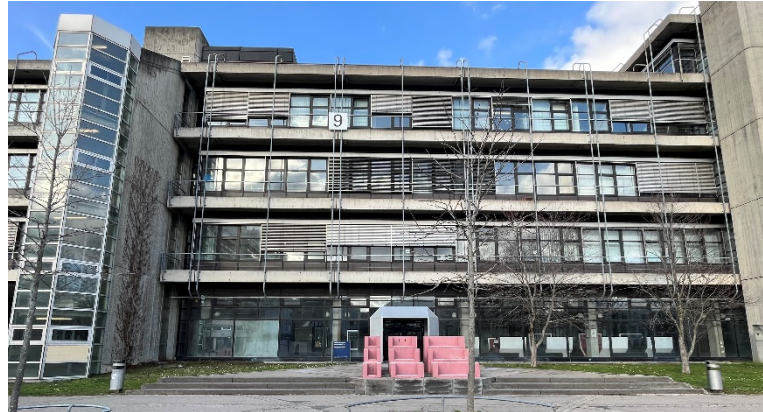
Main entrance to the building Pfaffenwaldring 9

Universität Stuttgart Institut für Systemtheorie und Regelungstechnik Pfaffenwaldring 9 70569 Stuttgart Seminar room Lyapunov 2.255 (2nd floor)