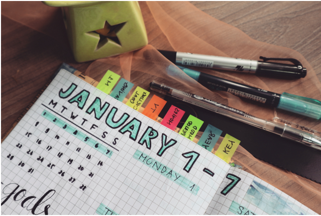
Fig. 2: Our busy lives, planned ahead.

forget about the gift after all! Since the party was in your calendar, Objectify had your back.