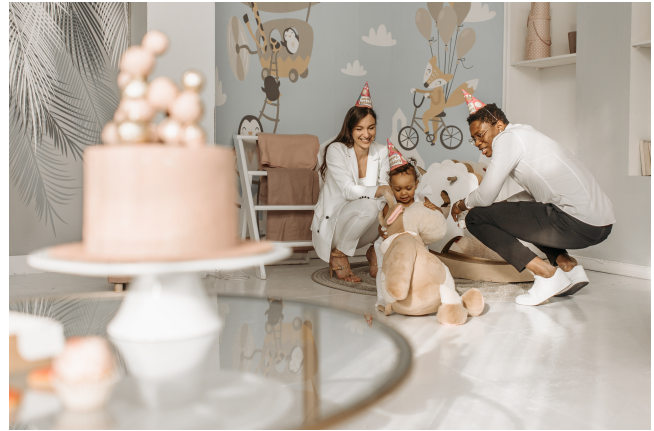
Fig. 6: Celebrations are a time to be surrounded by the people and things we love.

these limitations can be managed through different types of printers; it’s just that Valkyrie didn’t have access to them. “I just wish I had a food printer, the cake didn’t taste very good as it was,” she joked, plastic fragments obvious in her teeth.