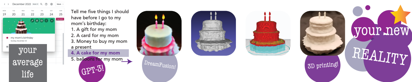
Fig. 1: Objectify's pipeline takes in a user's calendar data, uses a series of AI models to develop a bespoke 3D object based on it (generating text with OpenAI's GPT-3 [4]), then 3D models with Google's Stable Dreamfusion [14]), and either prints it right away or returns a ready-to-print version of the object to the user, with a timestamp indicating when to begin the print by.

Department of Computer Science & Department of Communication, University of Copenhagen Copenhagen, Denmark