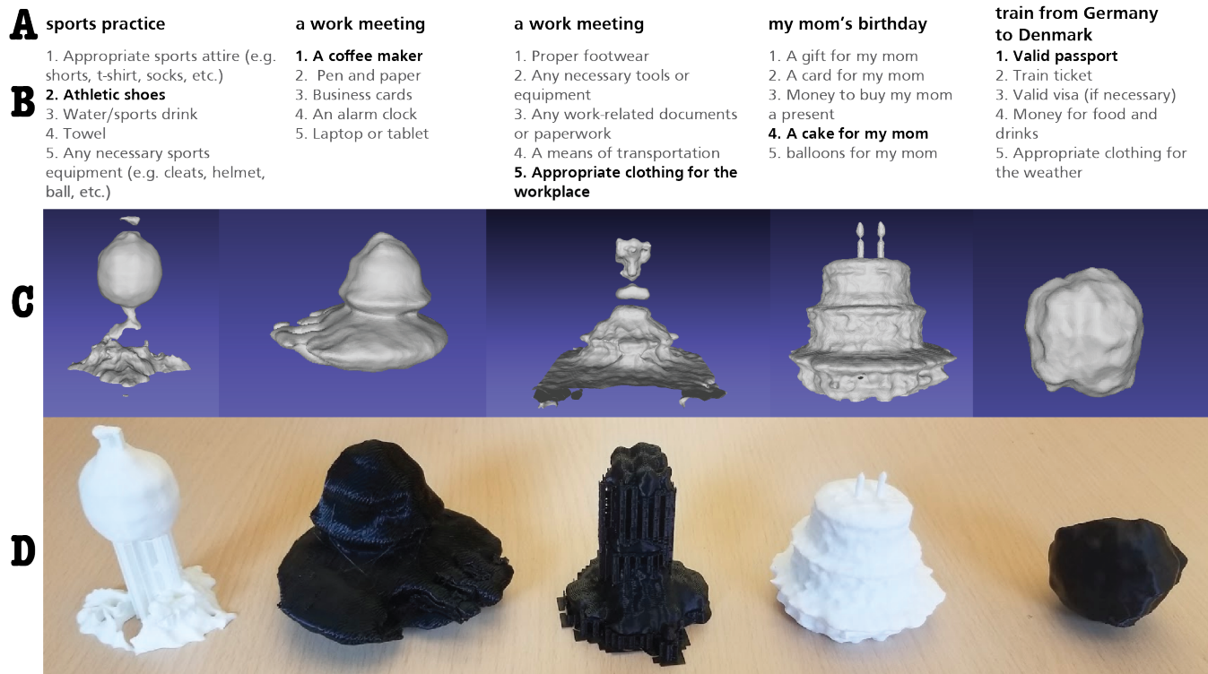
Fig. 7: Objects generated and printed by Objectify for Valkyrie's events: athletic shoes for a sports practice, a coffee maker and workplace-appropriate clothing for two work meetings, a birthday cake for her mom's birthday, and a passport for an international train trip. Row A is the prompt event, row B is the list of 5 items needed (sourced from GPT-3) with the randomly-selected one bolded, row C is the 3D model generated by the open source version of Stable Dreamfusion, row D is the printed model (support material was not removed from objects with hovering parts).

Valkyrie also mentioned how, in some ways, she found the objects less meaningful and could easily imagine throwing them away after a single use. This was in part because she had only to press “play” on the printer to get them. While this may seem wasteful, single use products are common and can often be effectively recycled. The ease with which Valkyrie was willing to let go of her objects could be a positive because letting go could create opportunities for generous donations to the less fortunate while opening up space in Valkyrie's life for new objects produced by Objectify.