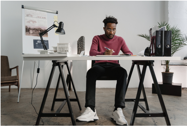
Fig. 5: In the workplace, we often need many items to achieve our goals.

anticipated my every move and what I needed; I loved it! It was almost like getting gifts from a secret admirer. The incredible objects it made for me... I felt really seen by Objectify.”