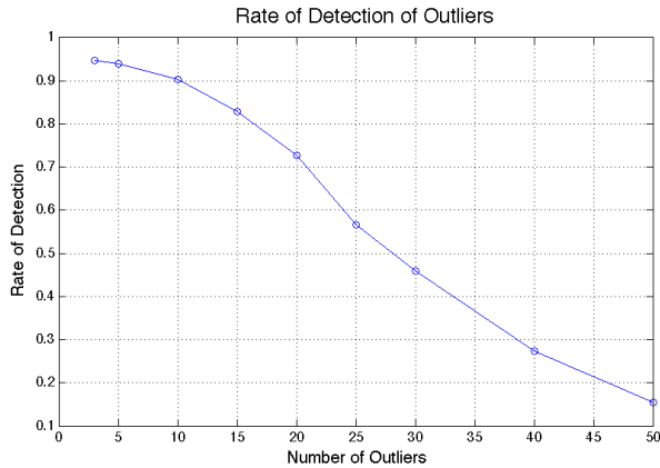
Fig. 2. This plot shows the rate of detection of outliers for a given number of inserted outliers. The rate of detection decreases as we insert more outliers in the data.