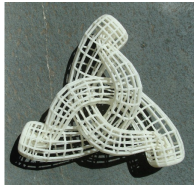
"Klein - Knottle"