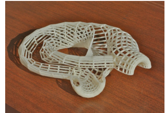
Classical Klein bottle cut into 2 interlocking Möbius bands.