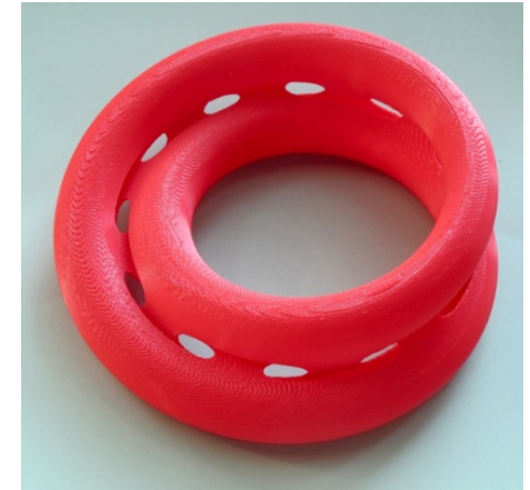
Figure-8 Klein bottles with 1 and with 12 punctures.