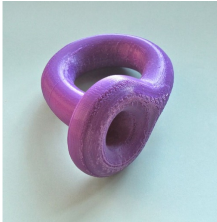
"Inverted Sock"-type formed from 2 Möbius bands.