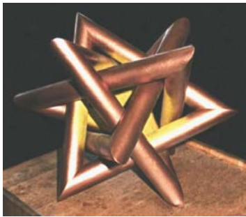
Basic Tetra Tangle.