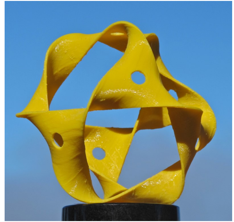
Two-sided Seifert surface filling in the triangular facets.