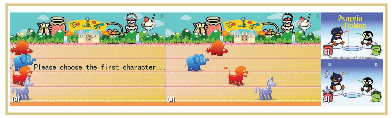
Figure 2. The Playful Tray games designed to improve children's eating behavior: (a–b) screen shots of the Racing Game; (c–d) screen shots for the Fishing Game.

Upon detecting each eating action, a random animal moves one step forward to the right. When the child completes the meal, the game ends, and the animal that's traveled the furthest wins. In the Fishing Game tray (Figure 2c and 2d), a child selects one of two penguins to compete in a fishing tournament. Upon each eating action, one of the penguins hooks a fish and drops it into a bucket. When the child completes the meal, the game ends, and the penguin with the most fish wins. To encourage parentchild interaction, a parent can participate in the game by choosing another animal or the other penguin to compete with the child in the same game. To discourage a child from taking small bites, the bites must accumulate above a certain weight threshold to trigger a game response.