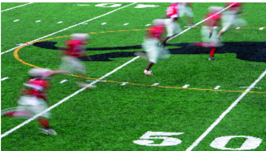
FieldTurf has moved onto AstroTurf's lawn