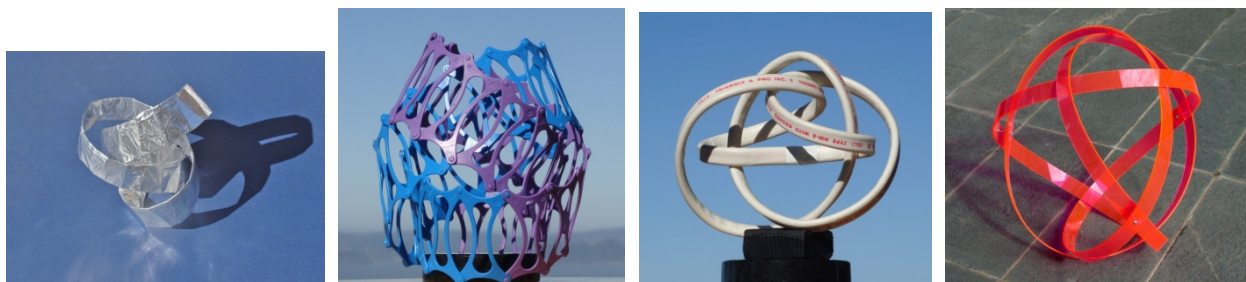
Figure 3: Ribbon sweeps with a flat profile along various knot curves, realized with: (a) aluminium foil, (b) Flexeez snap-together parts, (c) 3-wire electrical cable, (d) plastic strips.

Once a suitable knot curve has been found, a specific medium for implementation as well as the corresponding cross section of the sweep along the knot curve have to be chosen. A simple yet expressive medium is aluminum foil. A large sheet of aluminum foil is repeatedly folded into a flat multi-layered ribbon (about 3/8 of an inch wide). This ribbon is then manually formed to represent the chosen skeleton curve, while different amounts of twist can be applied to the ribbon before it is closed into the knotted loop (Fig.3a). There are other inexpensive materials suitable for making knotted ribbon sculptures: double-wire twist ties, which can be aesthetically enhanced by putting decorative adhesive tape on both sides; sturdy, colorful plastic sheets as are used in file folders; or even flat 3-wire cable. Some flexible snap-together parts such as “Flexeez” http://fixturescloseup.com/2011/01/20/flexeez-p-o-p-whatsit/ (Fig.3b) or “Knüpfli” http://www.dusyma.de/shop/Building-and-Constructing//223218-Knuepferli-Mixed-Packing-New-Colours--223218.html , also allow the formation of broad bendable ribbon structures that then can be closed into a chosen knot configuration.