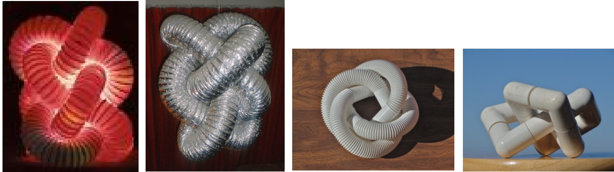
Figure 4: Knot sculptures made from: (a) 4” vinyl drier duct, (b) 6” aluminum drier duct, (c) flexible plastic piping, (d) PVC pipe segments and elbows.

Larger and sturdier knot sculptures can be obtained from vinyl or aluminum drier duct (Fig.4a,b), from flexible plastic tubing (Fig.4c), or from PVC pipe segments and elbows (Fig.4d). The latter approach would probably require making available at the workshop a simple PVC pipe cutter, to cut pipe segments to any desired length.