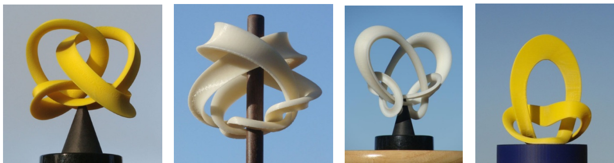
Figure 1: Knot-sculpture designs realized on a rapid prototyping (FDM) machine (2009-2010): (a) Knot 5-2; (b) Knot 6-1; (c) Knot 7-7; (d) Free-standing trefoil knot, Knot 3-1.

Given that this was a seminar for CS students, we also investigated the use of procedural deformations that would minimize overall energy of a uniformly charged wire shape by aiming to maximize the distance between adjacent lobes of the knot, and of transformations such as an inside-out reflection on the unit sphere to find new promising geometries for possible sculptures. Sweeping an appropriate profile along the optimized knot curve then resulted in a well-defined solid model of the sculpture geometry. Since we had access to a Fused Deposition Modeling (FDM) machine, the most promising designs were realized as small maquettes standing a few inches tall (Fig.1). Clearly these latter activities would not fit into a single-session workshop.