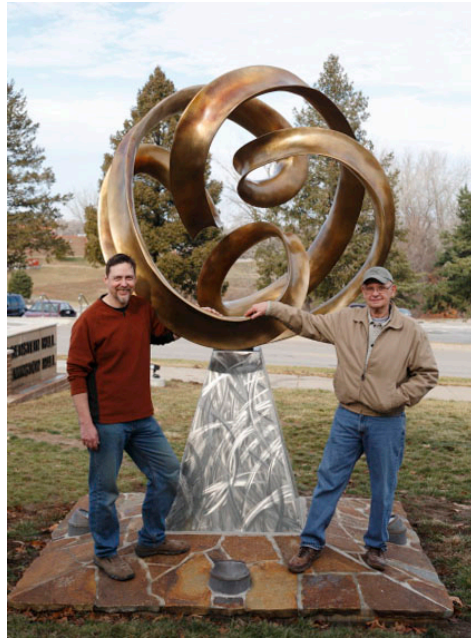
Figure 5: Large Bronze Sculptures:

(a) "Torus Knot-5-3 (version 2)" (August 2010) - Bronze, 16" tall. -- This sculpture won 2nd prize at the AMS annual exhibition of Mathematical Art in January 2011.